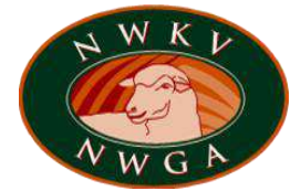
NWGA National Executive